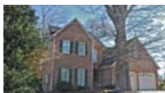
Stately Colony Woods! $199,900