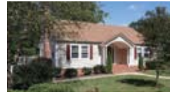
4BR! Full Bsmnt! Short sale! $165,000