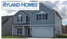
Only 2 left! Brand new! Buyer incentives! USDA eligible! $169,999 & $189,999