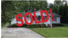
Deertrack! 3BR! $112,500