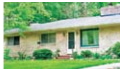
0.9 ac! 3 fireplaces! $149,900