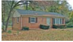
Catawba Hts! Large yard! $64,900