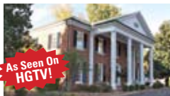
Belmont executive estate! $775,000