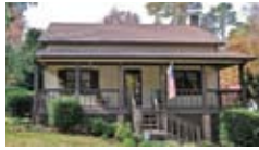
Abundant Charm! $149,900