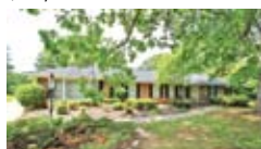
Heatherloch updated! $339,900