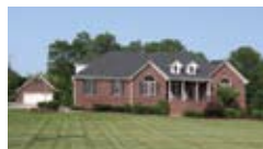
Belmont spaciousness! $429,900