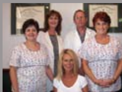
Belmont Chiropractic Staff

Personal Injury/Auto Accident Cases Workman's Compensation Sports Injury Children's Chiropractic Care Most Insurance Accepted