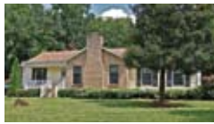
Belmont! Vaulted 3BR! $139,900