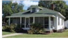
Mt Holly Business zoned! $129,900