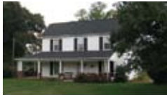
Vintage! 2nd Liv Qtrs! $179,900