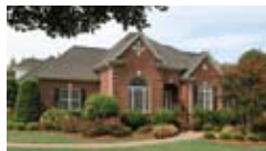
Gastonia! Extensive detailing! 4BR+ $579,900