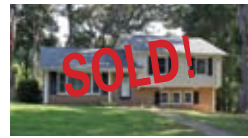
Gastonia! 4BR! $119,900