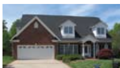
High end details! $339,900