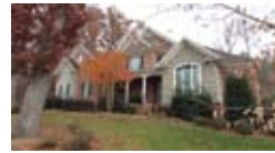
Executive 5 BR! St. Andrews $550,000