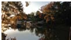
Waterfront Short Sale! $499,900