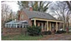
Classic beauty! 3BR! $249,900