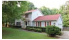
Mt Holly! 3BR close to EGHS! $139,900