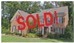
Belmont 5 BR! $315,000