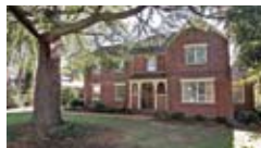
Gastonia elegance! $189,900